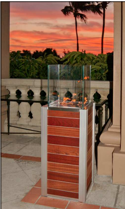
Fire towers shown in Jatoba wood with Lyptus aluminum banding.

Warm up the ambience with our custom Fire Towers. Great for both hospitality and residential applications.