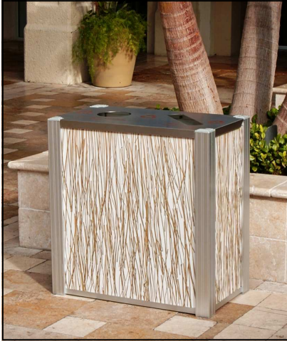
Double Recycler with 3Form Bear Grass Lite resin panels

Unify your design elements with our modular recyclers